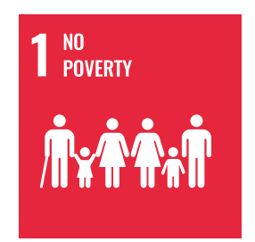
FIGURE 1: LACK OF PROGRESS TOWARDS THE SDGs